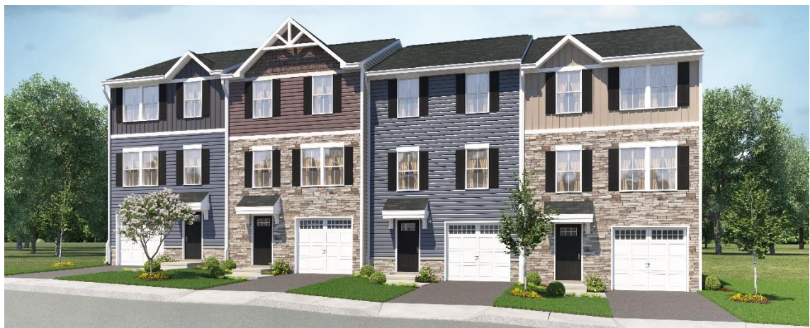
Artist's rendering/concept of one of Sanatoga Green's Townhome clusters.