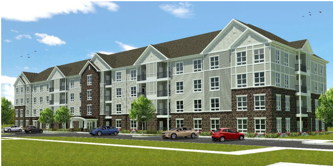
Artist's rendering/concept of Sanatoga Greene's Luxury Apartment Complex.