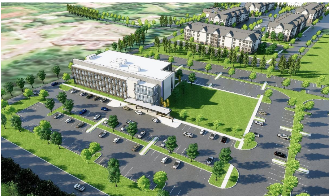
Artist's rendering/concept of the Sanatoga Green project – bird's eye view from north to south with Medical Office Buildings in the foreground.